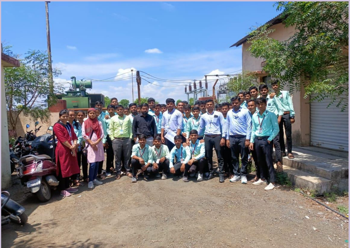
AT. MSEDCL YEOLA RURAL 33/11KV