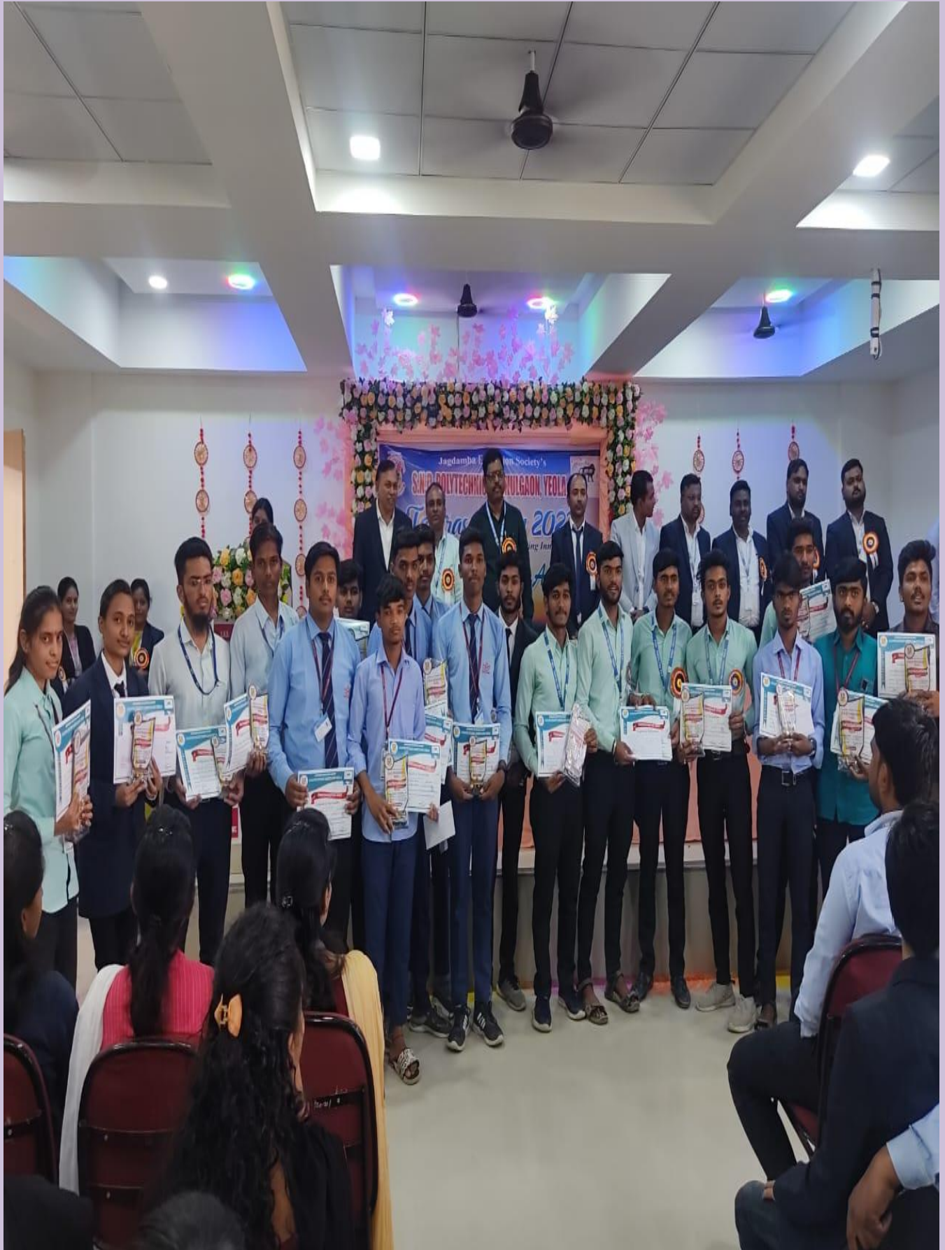
SND POLYTECHNIC ELECTRICAL DEPARTMENT 2022/2023