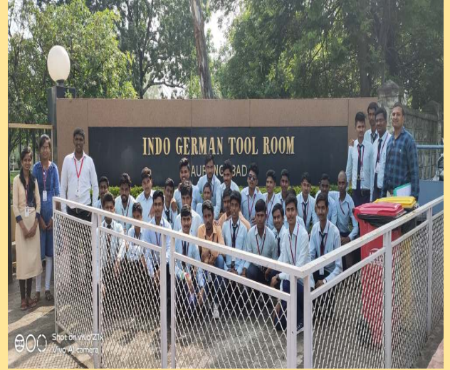
Industrial visit at M/s.Indo -German Tool Room, Aurangabad.