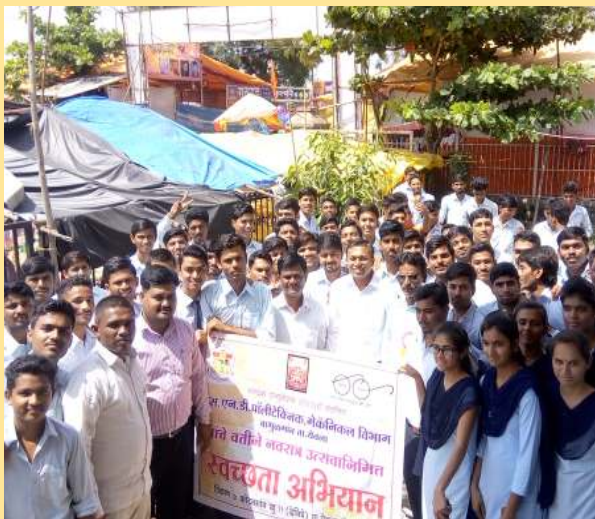
Gram Swachata Abhiyan