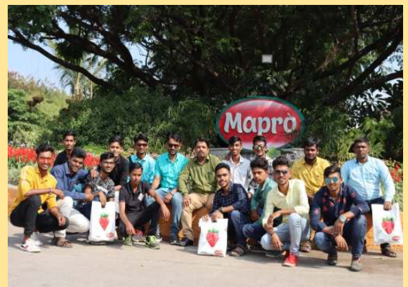
Industrial visit at M/s.Mapro Foods,Pune