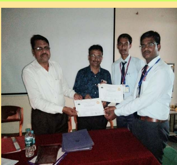
State level Paper Presentation at Government Polytechnic, Nashik.