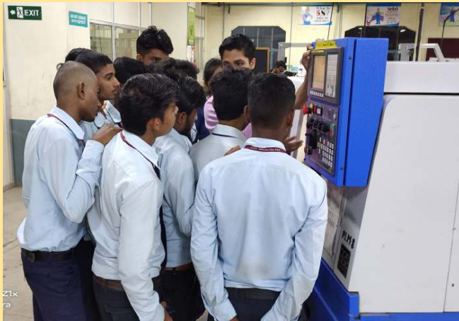
Industrial visit at M/s.Datson Engineers,Pune