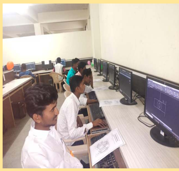
Students of Mechanical Engineering Performing practicals in laboratories.