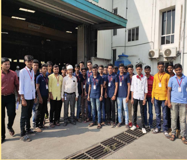
Industrial visit at M/s.Ratnesh Group,Pune