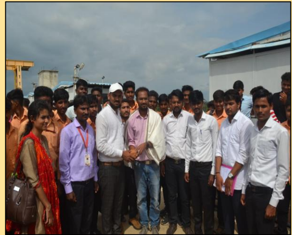
Third year students of civil engineering and Second Year students of civil engineering visited the Jaykwadi Dam, Paithan on 29/09/2018.