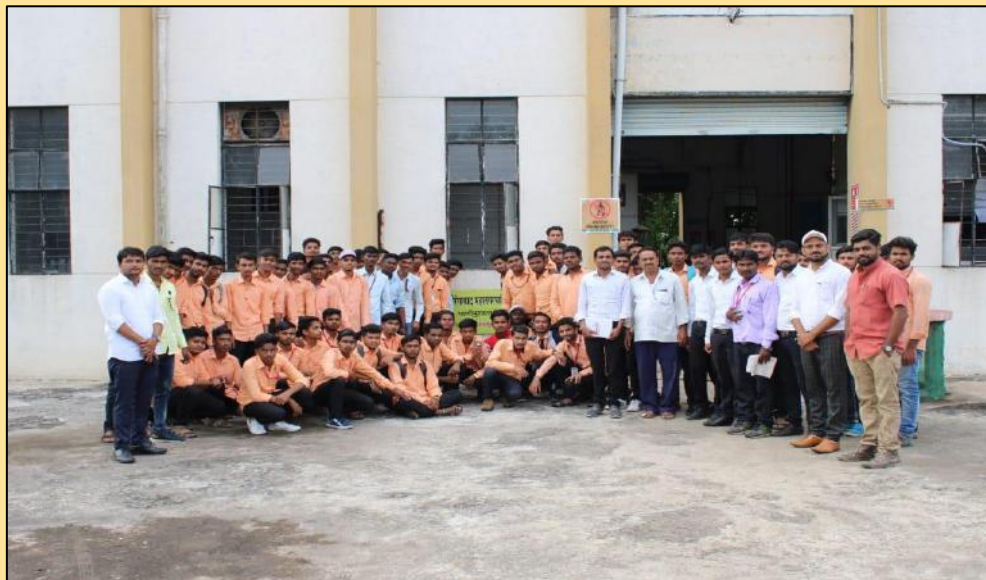
Third year students of civil engineering and Second Year students of civil engineering visited the Water Treatment Plant, Pharula on 29/09/2018.